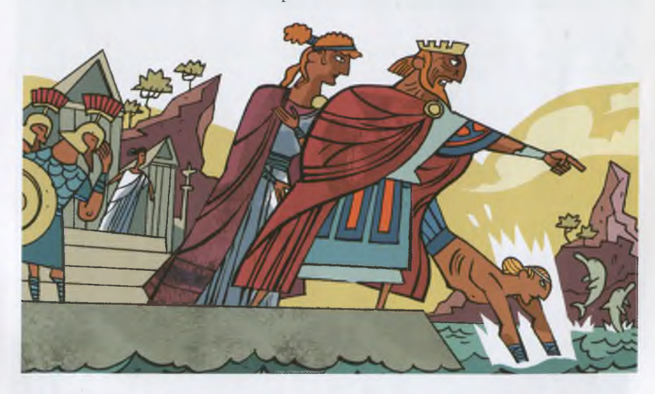
ring /rɪŋ/ (n) The girls have beautiful rings on their hands. dolphin /'dolf ɪn/ (n) Dolphins swim near the boats.

'The Minotaur had food today,' King Minos said. 'You can sleep.' But the visitors did not sleep.